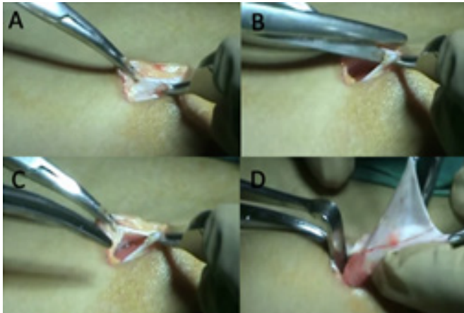
Fig.1 showing steps of GF technique, A. showing external oblique aponeurosis, B & C. external oblique aponeurosis is cut, D. hernial sac identified and separated from cord structures

In GF, inguinal herniotomy was performed after opening inguinal canal, hernial sac was then separated from cord structures and ligated [Fig.1]. In MB, inguinal herniotomy was done through the superficial inguinal ring, by dissecting the hernia sac from vas deferens and vessels without opening inguinal canal and then ligating sac at level of pre-peritoneal fat by applying gentle traction on superficial inguinal ring [Fig.2].